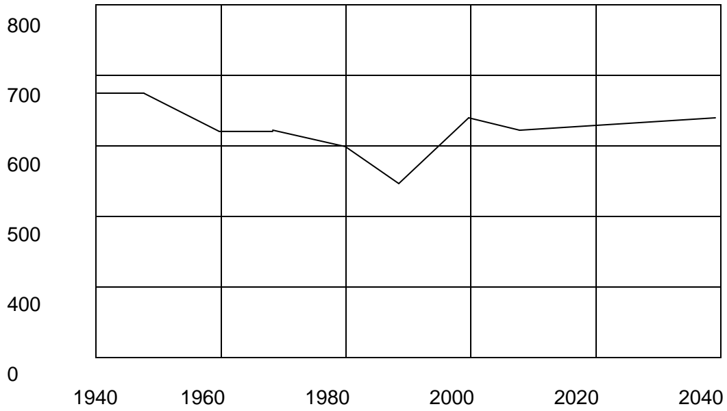
FIGURE 2 POPULATION PROJECTION 1940-2040